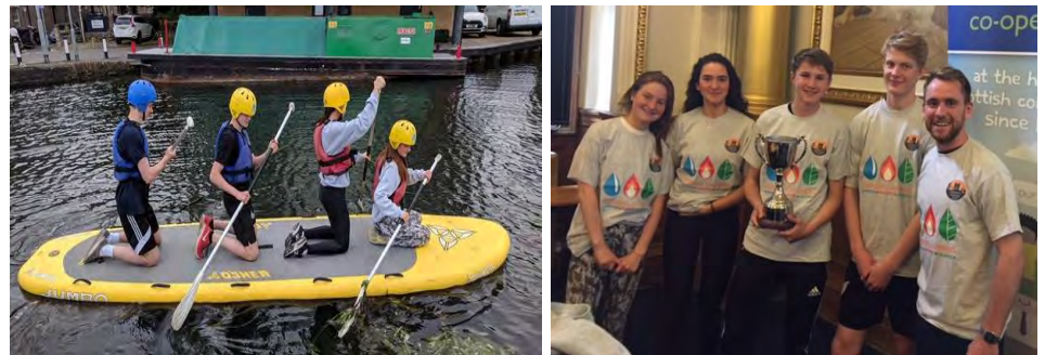
Boroughmuir's winning team in action on the canal and with their trophy

In June 11 teams took part in our annual adventure race across the city; the Convenor's Challenge . Now in its 4 th year, teams of 4 senior pupils and staff member scored points on adventure activities such as paddling, mountain biking and orienteering, and tweeting from the City's seven summits. This year was our most closely contested so far – Boroughmuir narrowly taking a well-deserved victory!