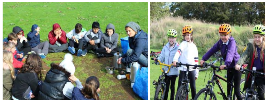
P6 pupils enjoy our first ever Outdoor Learning Challenge day

In February we held a consultation with Primary teachers on creating an equivalent event for Primary pupils, following which we started planning the Outdoor Learning Challenge . Six months later and 40 schools signed up we were all set to deliver over 2 days! An amber weather warning for first day planned sadly made it a clear decision to cancel. Thankfully the winds dropped (a bit!) and on Thursday 20 th September almost 900 pupils from 20 schools came to Holyrood Park to take part in our first ever Outdoor Learning Challenge.